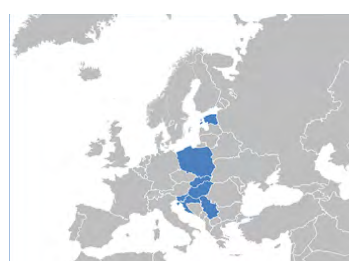
Figure 1. Distribution of countries involved in the project

Seven CEE countries were chosen to participate in the project: Croatia, Estonia, Hungary, Poland, Serbia, Slovakia and Slovenia (Figure 1).