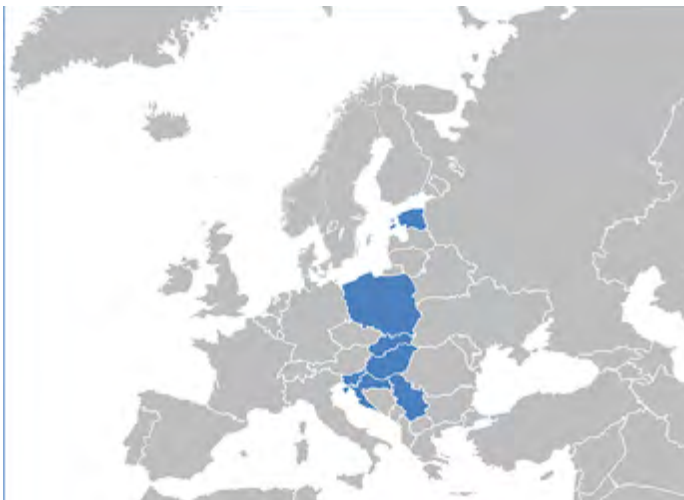
Figure 1. Distribution of countries involved in the project

Seven CEE countries were chosen to participate in the project: Croatia, Estonia, Hungary, Poland, Serbia, Slovakia and Slovenia (Figure 1).