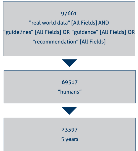
Diagram 1. First search strategies in the library database – PubMed

Results: Based on the performed search we have obtained in total 97661 records. We have restricted the search to "humans" 69517 and then for publications within last 5 years which allowed to obtain 23597 records (diagram 1). When analyzing the obtained records we observed that they were not fulfilling our criteria, as most of the publications were related to clinical guidelines for treatment of different conditions, not methodological guidelines about how real world data studies should be performed. With the 2nd search, we decided to restrict the search only to titles with the words we were interested in and we obtained 67 records. We have restricted the search to "humans" which allowed to obtain 40 publications. Reviewing all obtained records from the performed search we analyzed in detail the abstracts and after analysis of the full texts we found 2 publications fulfilling our criteria (diagram 2). The final selection was done independently by 2 authors before the final inclusion decision was taken. Since we were not satisfied with the findings we continued searching additionally on the internet site of scientific organizations (ISPOR) and HTA organizations (NICE) where we found two additional publications which we decided to include in our discussion.